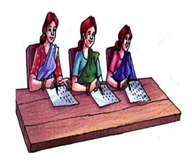
त्वम् ......खादसि । <sup>3</sup>लेख<sup>´</sup>