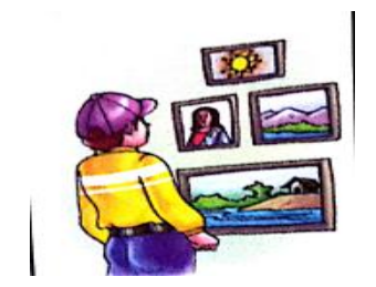
अहम् .....पश्यामि ।• <sup>3</sup>चित्र<sup>′</sup>