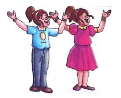
अहम् .....पश्यामि ।• <sup>3</sup>श्लोक<sup>′</sup>