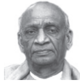
(B) Sardar Patel