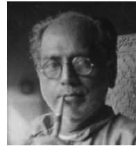
(B) Abanindranath Tagore