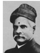
(D) Raja Ravi Verma