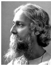
(A) Rabindranath Tagore

7. Who painted the famous painting of Bharat Mata?