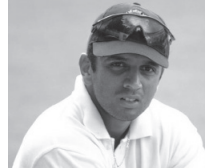
(D) Rahul Dravid

8. Which city was made the capital by Rashtrakutas?