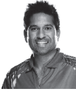
(A) Sachin Tendulkar

7. Who among the following has become the first Indian to score a triple century in tests?