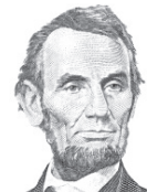
(D) Abraham Lincoln