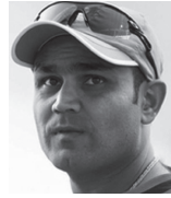
(B) Virendra Sehwag