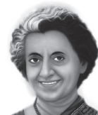
(B) Indira Gandhi