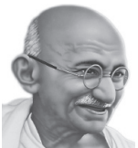
(A) Mahatma Gandhi

12. Who said, "Democracy is a government of the people, for the people, by the people."