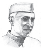
(C) Jawahar Lal Nehru (E) None of these