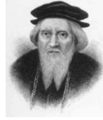
(B) John Cabot