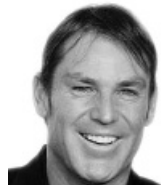
(A) Sachin Tendulkar (B) Brian Lara