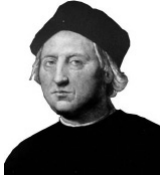
(A) Christophorus Columbus