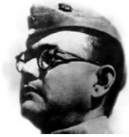
(A) Subhash Chandra Bose

14. 'The Azad Hind Fauj' was organised by?