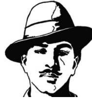
(B) Bhagat Singh