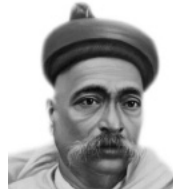
(D) Bal Gangadhar Tilak

15. 'The Blue Revolution' was launched in 1994 by the government with the objective of teaching aquaculture to the people living in coastal areas engaged in?