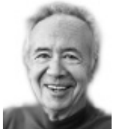
(C) Andrew S Grove (E) None of these