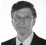
(A) Bill Gates

11. Who was the founder of Oracle Corporation.