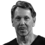
(B) Lawrence I. Ellison