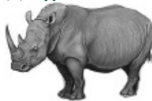
(D) White Rhino

9. Which one of the following parts of plant uses sunlight to make food ?