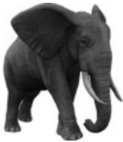
(A) African Elephant

8. Which one of the following is the world's largest land mammal ?